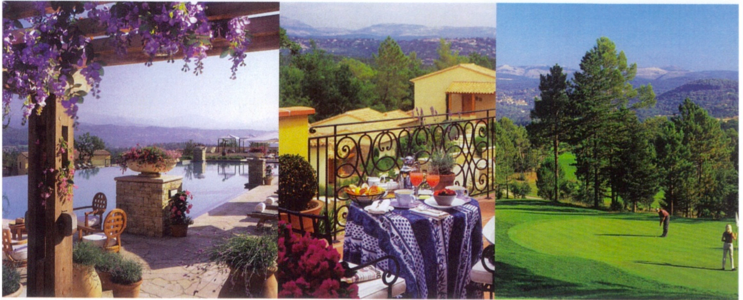
LEFT TO RIGHT: Wisteria drapes the loggia at Provence at Terre Blanche, the Four Seasons' first resort in Europe. Breakfast with a view. Typical Provençal tablecloths make fine souvenirs. The scenic seventh hole at Terre Blanche's championship course.