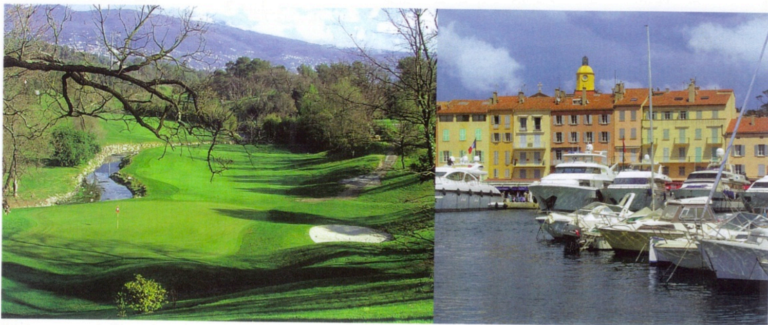
LEFT TO RIGHT: Robert Trent Jones Junior designed the St. Donat Golf Course that meanders around an ancient hunting estate near the hilltop town of Mougins. Mega-yachts line the pretty pastel port of Saint-Tropez made famous by sex kitten, Brigit Bardot back in 1956.

away. Built on a valley estate that belonged to a countess, this championship track by Robert von Hagge defines target golf, especially on the signature par-three (Angel's Jump), requiring a shot from cliffside hugging tees over a waterfall and pond to a postage-stamp green. It's a preview of the narrow and watery adventure to come.