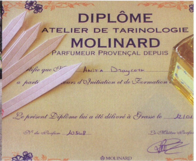
LEFT TO RIGHT: The patio of the Domaine de Châteauneuf is a pleasant spot for an aperitif after a round on the neighbouring St. Baume golf course. Participants in the cologne-making workshop in Grasse receive a diploma and a bottle of their signature scent.

opulent fabrics and fine antiques. Soak in a huge tub in your marble bathroom while watching a flat screen television that has been cleverly mounted onto the mirror and you'll find that Le Mas allows guests to enjoy period trappings, without being trapped in the past.